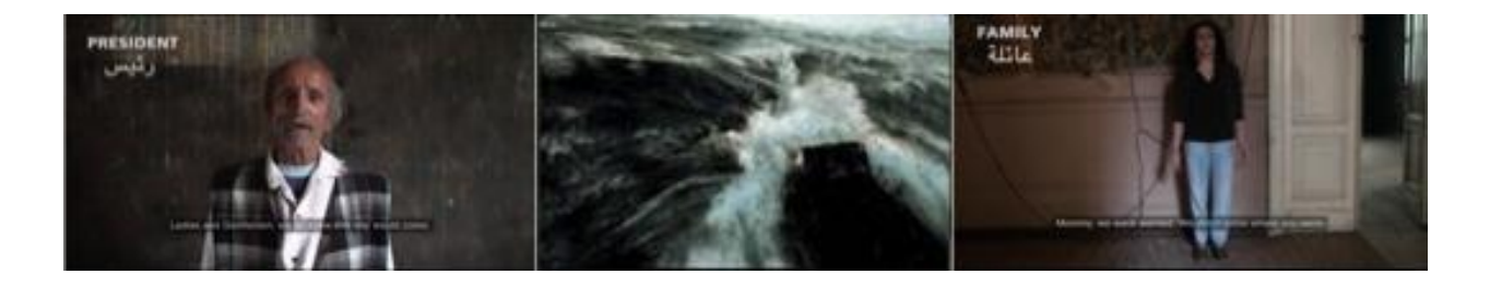
Figure 1: Stills from Disastrous Dialogue , courtesy of Søren Thilo Funder

The actors appear in Disastrous Dialogue with their role ascriptions written in the corner of the screen. They change roles throughout the film and are at times ascribed rather surprising roles, as when for instance a man is "mother" and an elderly woman "soldier". Rather than rendering the lines, actions and roles meaningless, however, their new order and setting works as a recontextualization; a distinct dynamic is created between them as they are put together in Disastrous Dialogue , a novel meaning potential is created.