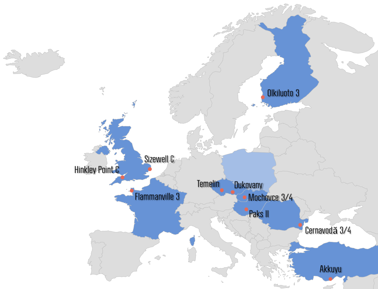
Figure 2: Recent European NPP projects and countries featured in this report. U.S. projects are not shown.