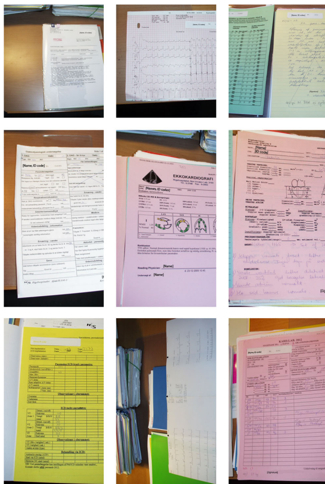
Figure 2. A sample of the multitude document and data types in the patient folder.

first sheet is a generic table of contents printed on a white sheet of plastic, and the content of the folder is organized into corresponding sections divided by colored separator sheets with inscribed tabs: ‘Clinical notes’ (grey), ‘Cardiographic tests’ (orange), ‘Paraclinical tests’ (yellow), ‘ECG and Holter’ (green), and ‘Dispatch letters’ (blue). Within each section, sheets are placed in inverse chronological order (with exceptions due to haste, mistakes, etc.).