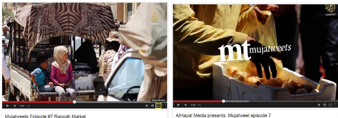
Figure 3 Raqqa Market Scenes

stalls. Food and consumer goods are obviously available. They are bought and sold in an orderly fashion. There are no queues and no signs of shortages. People go about their everyday food shopping in a leisurely and comfortable way. Another example is the Mujatweet #4: 'Life in Mosul prospers under DAESH'. It shows a shopping-centre, well-kept cars running on well-maintained roads, and shopping scenes. 22 The significance of the commercial is captured also by the effort that goes into signaling its limits. These limits are indeed not dissimilar to prevailing understandings in the West. For example, in one video an Australian doctor explains that DAESH offers 'free healthcare'. He does so in a modern looking maternity ward (AN, 2015). The logo of the Islamic State Health Services (ISHS) mimics that of the British NHS. 23 Markets, consumerism and shopping are visibilized in the recruitment videos to an extent where it seems important also to visibilize their limits.