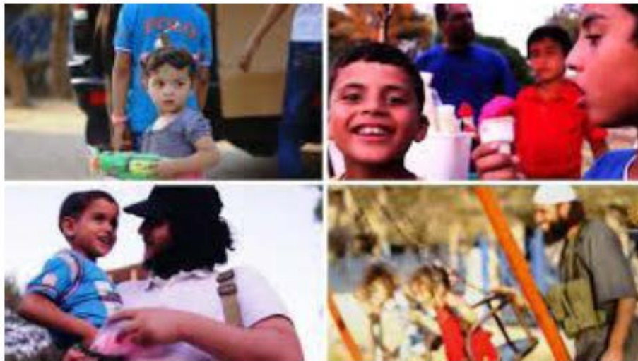
Figure 1 Collection of Pictures from Mujatweets

Analyzing the practices re-producing the aesthetics of DAESH (in)visibility confirms that they are characterized by malleable, mundane marketing. Even more strongly, it shows that commercial, digitally afforded, combinatorial aesthetic practices frame the overall (in)visibility of the videos and hence the imaginaries associated with them.