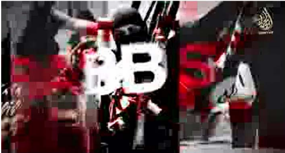
Figure 2 Music Video Picture

Western amusement, games and music (Lister, 2014: 26). Hence a recruitment video circulated in Canada shows the unlikely scene of recruited Canadians playing hockey and fishing. 15 Recruitment videos feature rappers from Germany, France and the UK (for an overview see e.g. NY Daily News, 2014) and/or adopt the style of the Western rock music video, as shown in figure 2. 16 Gaming videos have been produced that echo recruitment strategies of public armed forces also in the West. 17 One recruitment video is a version of the 'Grand Auto Theft' videogame with figures, music and landscapes promoting the idea of fighting for DAESH. 18 The video game begins by proclaiming that life with DAESH will be an online gambling reality relocated to the real world: 'Your games which are producing from you, we do the same actions in the battlefields!' 19