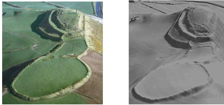
Fig. 1. The two images above show an aerial photograph (left) and a virtual 3D model created with LiDAR data.

The images (figure 1.) show an aerial photograph of the site and an image of a 3D model created from LiDAR data, which is openly available. Having access to the LiDAR data means that models can be quickly made, printed as physical 3D models, or virtual models imported for example into Max/MSP. The LiDAR data can also be used to alter the pitch, volume, and chosen sound and could also be used as a triggering mechanism. At this stage of the project we are using the shapes contained within the site as a way through which we can start the initial ideation or design phases of the project, enabling us to ask people to engage in the design process and develop early prototypes.