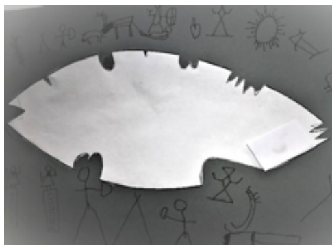
FIGURE 1: A student's handcraft of their family's reindeer earmark in Sodankylä

the northern local culture as a whole differs from the Finnish mainstream culture because of the traditions of herding reindeer, fishing, hunting and berry picking in the forests. Sodankylä's local curriculum, which incorporates northern Finnish culture, provides a good example of cultural sensitivity; for instance, students are taught about the eight northern seasons and how they reflect the important elements of nature. The eight seasons are frost winter , snow crust spring , ice run spring , nightless night , harvest time , nature's autumn coat (ruska) , first snow and polar night (kaamos) . Another example in which the local culture is appreciated in school involves inviting parents to introduce their occupation as reindeer herders and students visiting reindeer-gathering places and becoming acquainted with the reindeer earmarks (see Figure 1).