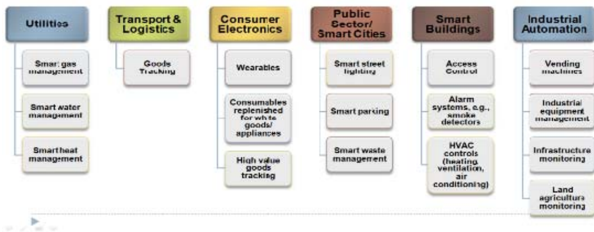
Figure 1. IoT in Various Industries and Use Cases (Shim, Dam, Coursey, & Barney, 2017b)

One can apply the IoT to and adopt it in various industries, such as utilities, transportation and logistics, consumer electronics, public sectors/smart cities, smart buildings, and industrial automation. Figure 1 demonstrates numerous use cases in various industries (Shim et al., 2017a; Kamilaris & Pitsillides, 2016). One can fundamentally dichotomize the IoT into two types: consumer IoT and industrial IoT. Consumer IoT encompasses common devices for everyday use that revolve around end-user consumption, such as smartphones, tablets, refrigerators, televisions, and household appliances. Industrial IoT involves the transformation of industries, such as power companies using the IoT to control electrical grids and transportation agencies controlling traffic signs. Connectivity has become a significant component of everyday life from the home to the office. Figure 2 illustrates numerous connected enterprises, such as open architected common platforms; edge-enabled devices, data, and analytics; global-scale data and analytic services; and common applications and service workflow. Furthermore, these enterprises comprise connected buildings, vehicles, workers, homes, plants, aircraft, and supply chains. These examples represent a fraction of connected devices since IoT also covers remote monitoring devices used in remote locations. A dramatic increase in machine-to-machine (M2M) installations characterize the IoT's diffusion.