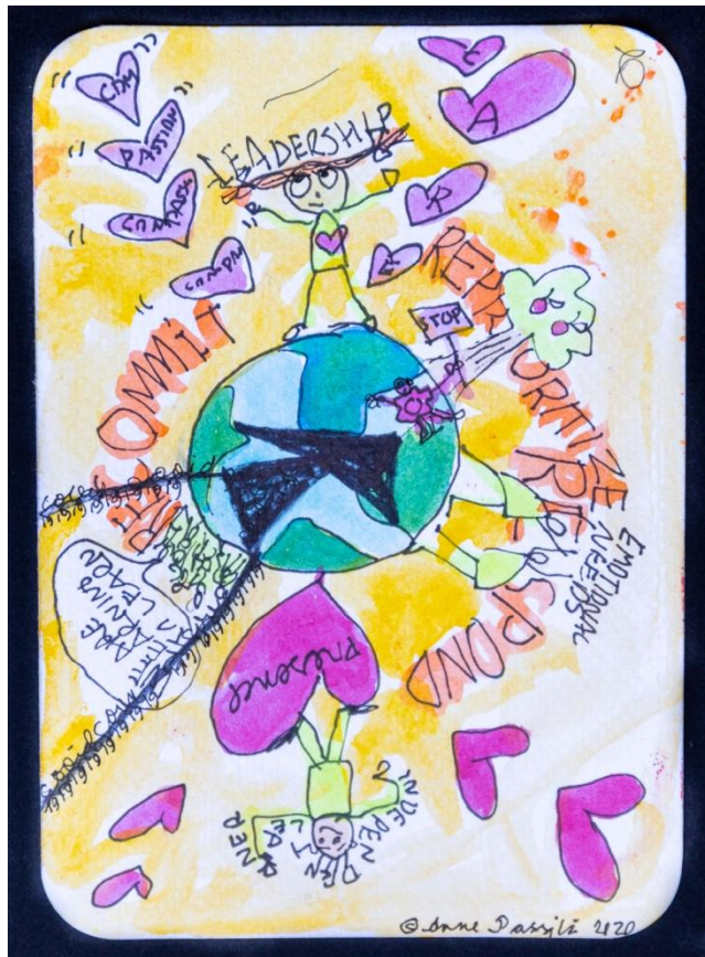
Figure 2(a) Localisation