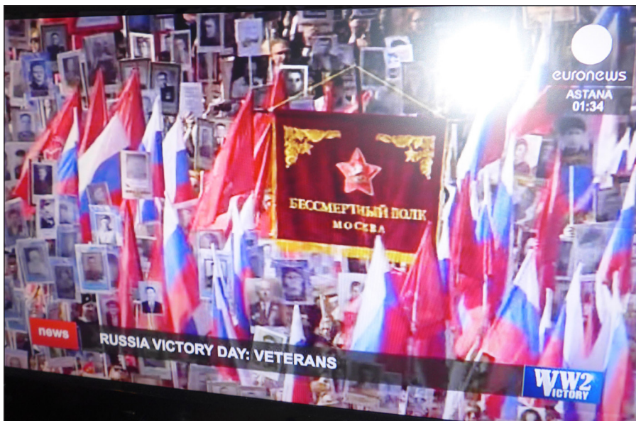
Figure 1. The bessmertnyi polk - Moscow, Red Square, May 9, 2015

Figure 1 illustrates a powerful recent political effort to mobilize the personal family ties into the service of expansion of patriotic unity feelings around the issue of celebrating 70 years from the end of World War 2 in Europe. The history of a war won (or lost) matters – and is made to work for – the future. New generations, carrying the photographs of their deceased relatives who were in the war, join the promotion of the new vigilance of defense of their country in the future. Adding the notion of eternity ( bessmertnyi , immortal) to the collective military unit ( polk , a battalion) carries the affective personal links with one's relatives forward to future readiness to devote the lives of the young (and their children) to the future political needs of the “fatherland”. Patriotism is promoted in all societies (Carretero 2011) and its function is set up ahead of time when it is needed to achieve concrete political goals. The nature of wars may change in history (Beck 2005; Leach 2000) yet these remain – as von Clausewitz (1908/1832) pointed out in the nineteenth century – a continuation of politics through military means (Roxborough 1994). The wars fought in the courts of law in any country, or between them, are peacetime continuations of the military acts on real battlefields.