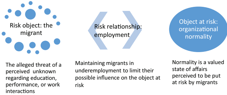
Figure 2. Using the relational theory of risk to explain the underemployment of highly skilled migrants as an organizational logic.