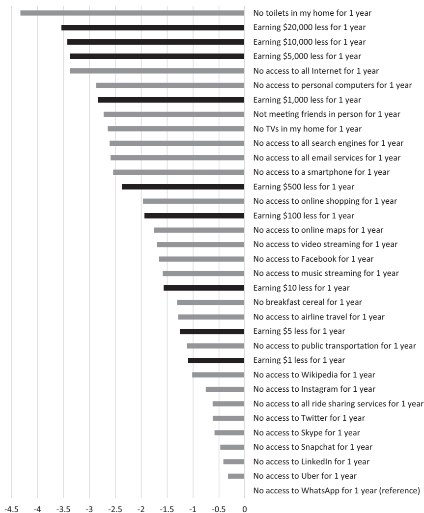
Fig. 2. (Dis)Utility according to BWS.

Our approach evaluates goods for a specific time period from the consumer’s perspective. This is not necessarily the same as the goods’ social value or their values for different time periods. For instance, some goods might have negative externalities that hurt other people’s well-being [e.g., fake-news sharing via social